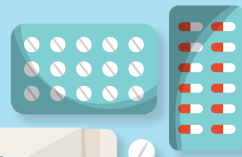
Non-Prescription Drugs Pain reliever, anti-diarrhea medication, antacid, laxative