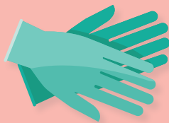
Disposable Non-Porous Gloves Latex-free and vinyl