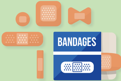
Adhesive Strip Bandages