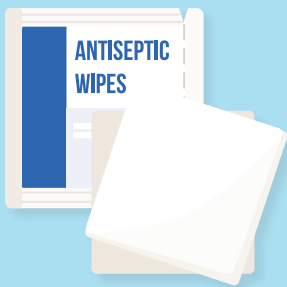
Antiseptic Cleansing Wipes Use these to clean wounds, cuts, and scrapes before applying cream or bandage