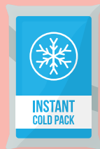
Instant Cold Pack