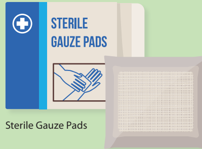
Sterile Gauze Pads